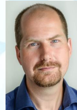
Ondrej .cz (observer)