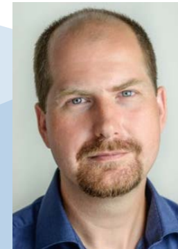
Ondrej .cz (observer)